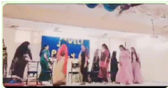
Fun game musical chair performed by Final year students 6:42 nm ✓

The Farewell function begun with the theme “Every Ending has a new beginning” and followed by fun games which were conducted by the juniors to the seniors such as "musical chairs" Later the final year students were asked to give their opinions about the institution and the teachers. All the students were felicitated by the Principal and Coordinator.