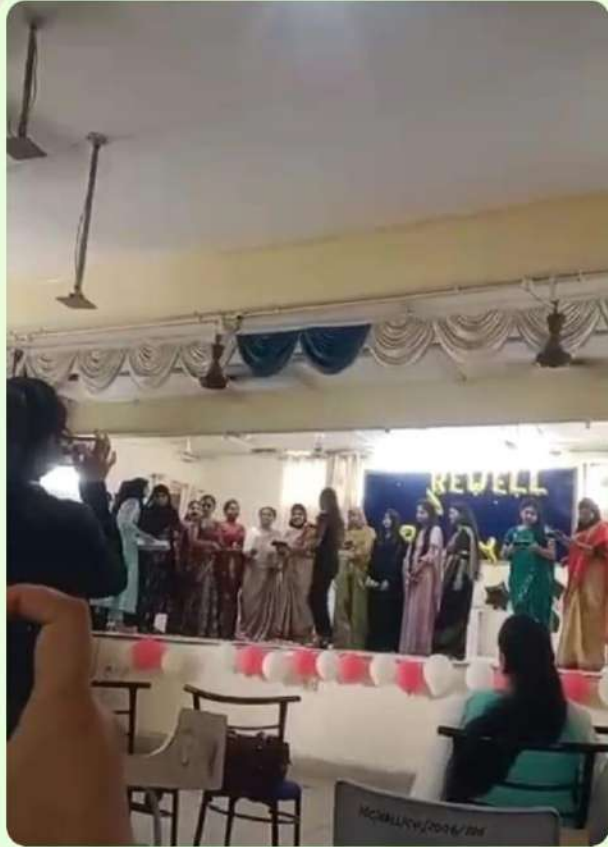
Final year students felicitated by the Respected Principal