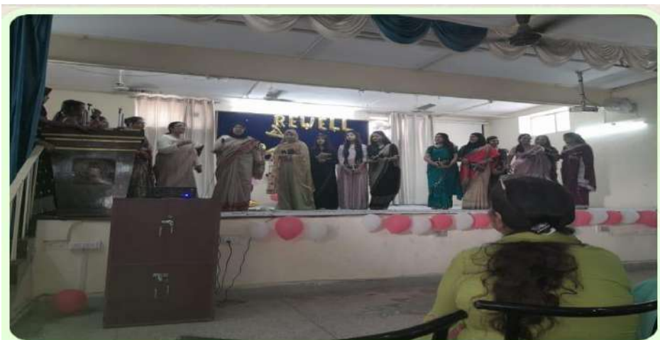
Final year student on the stage alongwith Principal, Coordinator and Fashion Design Faculty