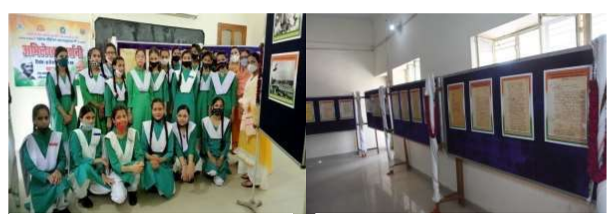
Students from Hamidia Inter College participating in Exhibition