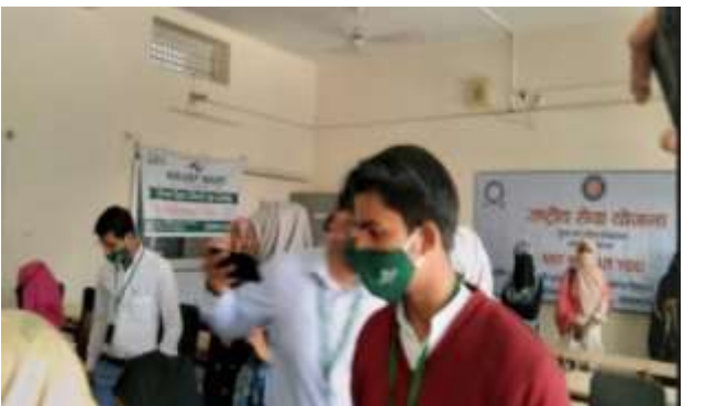
Free Eye Check-up Camp 25 February 2021 organized by the Rotract Club, SHAFQA & NSS, HGDC